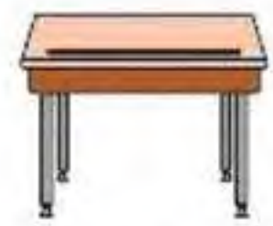
ta . le