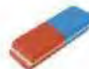
er . ser