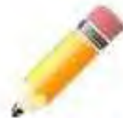
p . ncil