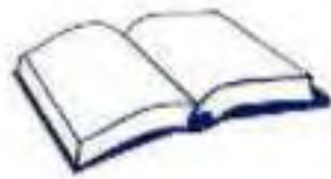
bo . k