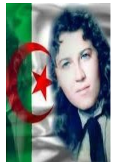
Glory to our martyrs