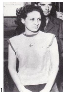
1 Zohra Drif arrested during Algiers’s battle