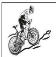
2- mountain biking