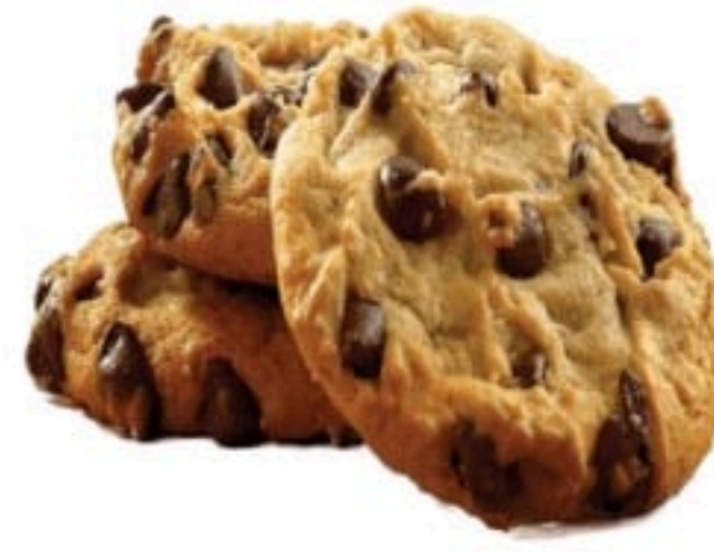
... cookies ...