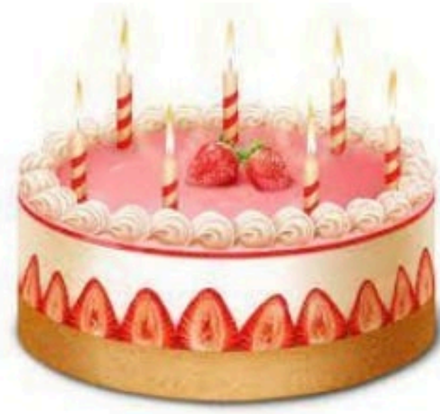
... cake ...