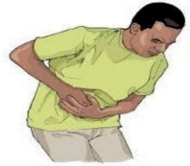
... stomach-ache ...

Task Two (05 pts): I complete the following paragraph with: (should – shouldn't)