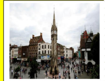
The clock Tower