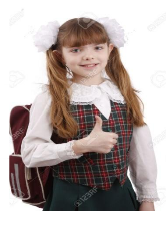
Task 3: I help Sara find the right word .(02 pts)