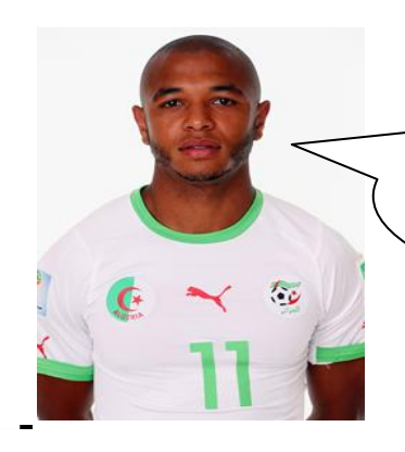
<u>Task 2</u>: I read and supply the capitalisation and the punctuation_(03 pts)